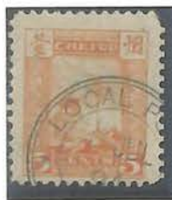
5c Stone II