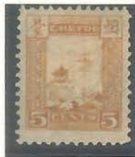
5c Stone II