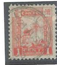
1c Stone II G