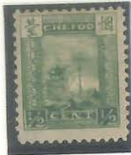
1/2c Stone IV P