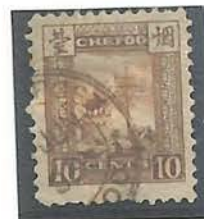
10c Stone II A