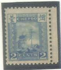
2c Stone II