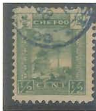
1/2c Stone IV K