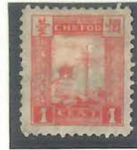
1c Stone II D