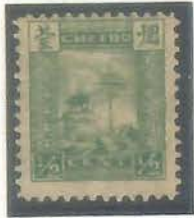
1/2c Stone III F

1894 Lithographed, Retouched Die, Normal Watermarked, Perf. 11½ In sheets of 40 (5 x 8) by Scheicher and Schull, Duren, Germany