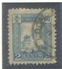
2c Stone II