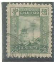
1/2c Stone III G