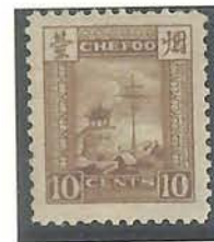
10c Stone II J