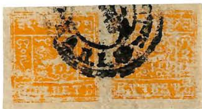
Dull orange, smudgy print, cliches 10,8 1951, Phari