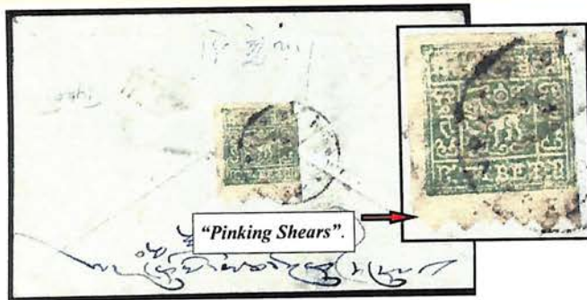
Y110 Registered Commercial Cover from Gyantse f.w. 4tr Green cut with "Pinking Shears". (Waterfall P.109)