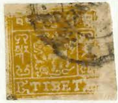
Bistre, 1940, less than 20 known