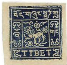
First setting, imperf, cliché 3, scarce dark ultramarine shade, (most copies of first setting are perforated).

Dark blue proof sheet of two (only seven recorded), clichés 5,3. This combination of clichés does not occur in the normal sheets.