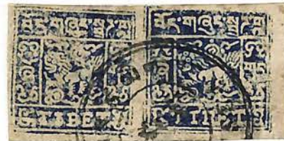
Third setting, clichés 4,10, deep blue