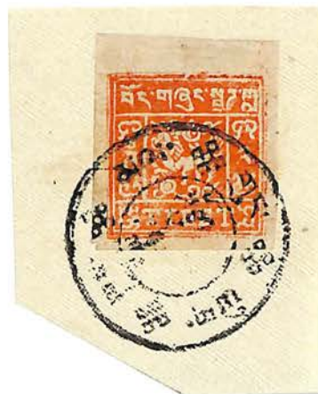
Dull scarlet, cliche 4, 1955 Medogonkar