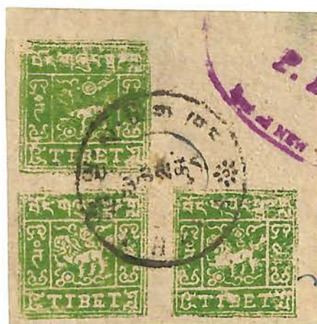
Emerald, clichés 3/7,8 from upper right corner of sheet. Cliché #4 was lost in 1937 and for a number of years sheets were printed with only 11 subjects. Setting Id with "E" flaw in cliché 7 and "B" flaw in cliché 8. Native Lhasa cancel and violet handstamp of a bank.