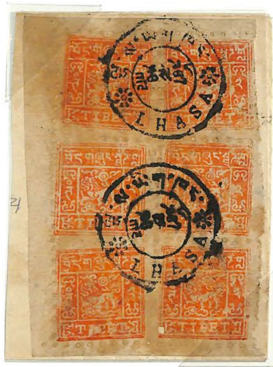
Setting Ib (second state with cliche 5 into margin), scarlet vermilion, 1945, cliches 1,2,5,6/9,10, perforated