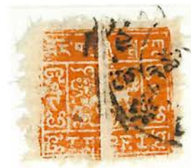
Orange red, paper crease