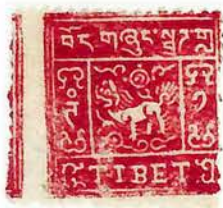
Carmine red, cliché 8 pin-perforated