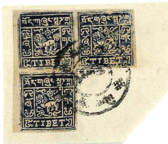
Third setting, clichés 12,5/1, deep indigo Medogonkar cancel