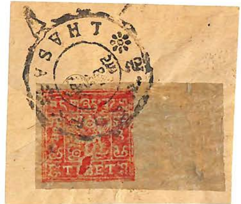
Cliche 3, carmine red, 1941-1942 Lhasa