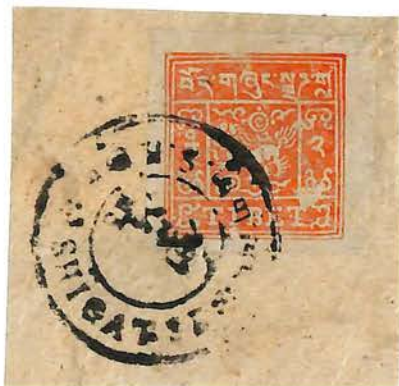
Bright orange, cliche 2, 1950 Shigatse