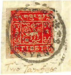
Cliche 4, scarlet, 1933-1939 Gyantse