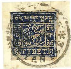
Cliché 7, deep blue, Gyantse cancel