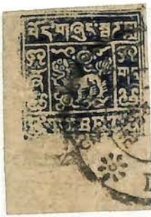
Cliché 2, deep blue, Lhasa cancel