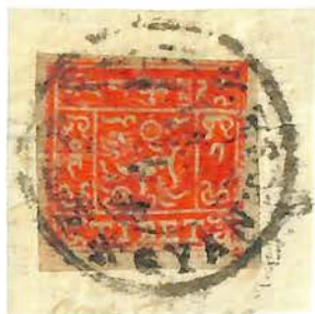
Rose carmine, cliché 8, 1936-1938