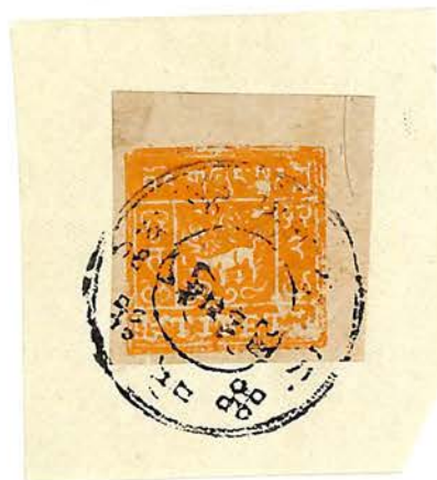
Dull orange, cliche 2, 1951 Dechen