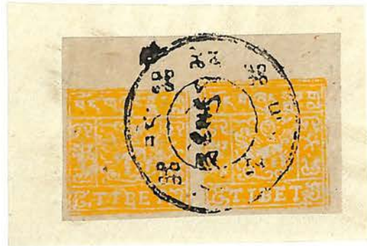
Third setting, yellow, cliches 10,8, Dechen cancel, 1945