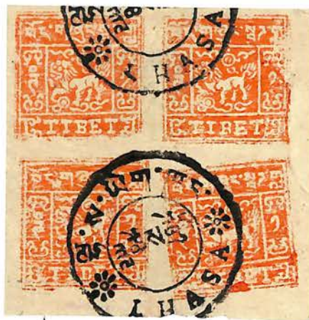
Third setting, orange vermilion, clichés 3,1/8,9, 1948-1953