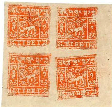
Third setting, reddish vermilion, cliches 3,1/8,9