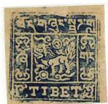
Cliché 5, gray blue