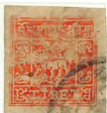
Dull scarlet, cliche 6, 1955