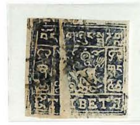
Pin-perforated-- cliché 7, dark blue (left), and cliché 4, bright Prussian blue