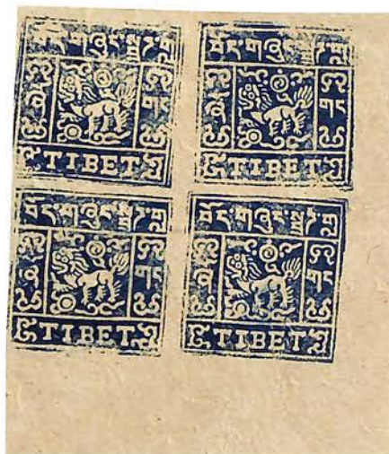
Fourth setting, clichés 5,1/4,3 gray blue