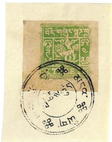
Yellow green, cliché 9 Native Gyandie strike