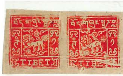
First setting, carmine rose Clichés 11,12; preprinting fold