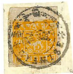
Fourth setting, chrome, cliches 11,2/1,9, Lhasa, 1952-58