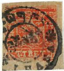
Cliche 2, carmine red, 1941-1942 Lhasa