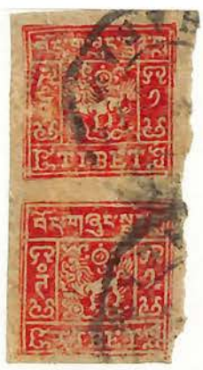
First setting, rose lake, cliches 5/9