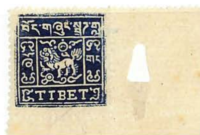
First setting, perforated, cliché 12, Prussian blue, with paper staple