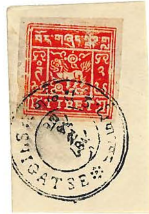
Cliche 5, scarlet, 1933-1939 Shigatse