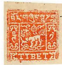
Reddish vermilion, cliché 7