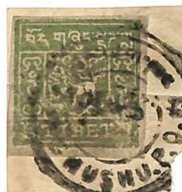
Gray green, cliché 12 Chushu strike