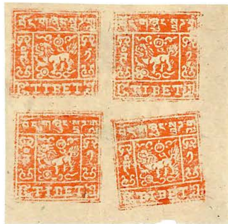
Third setting, orange vermilion, 1948-1953, clichés 3,1/8,9