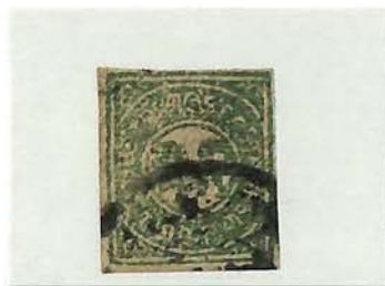
Green (early colour)