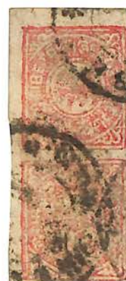
Unusual pink shade, multiples are scarce