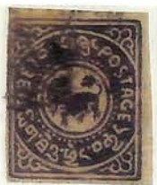
Deep violet, 1912-1915