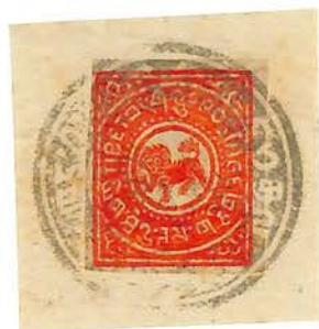
First printing, vermilion, negative Gyantse cancel.