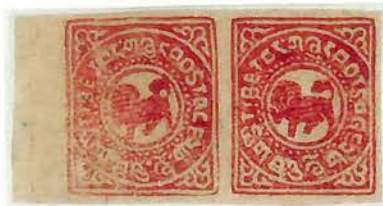
Carmine rose, positions 5, 6