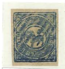
Dull Grey Blue