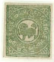
Light gray green