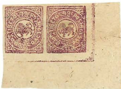
Pale reddish purple, shiny enamel ink, c. 1928