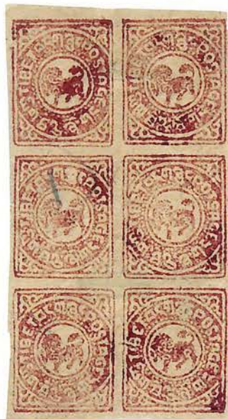
Carmine lake, shiny ink. Positions 2,3,6,7,10,11.