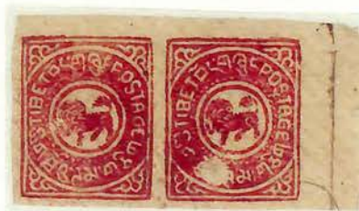
Carmine-red (color intended for the 2/3 trangka), shiny enamel ink, c. 1930