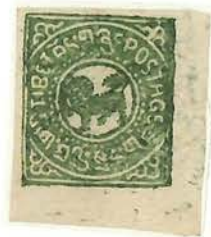
Dark gray green