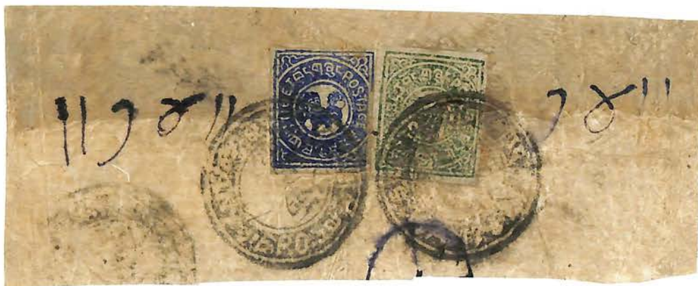
Unusual combination of 1/6 trangka and 1/3 trangka to achieve the 1/2 trangka letter rate