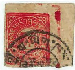
Scarlet, 1912-1915 (early printing)