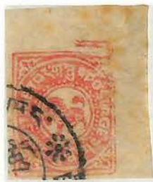
Rose, position 4, print variety