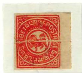
PRE- PRINTING PAPER FOLD