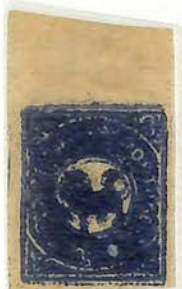
Dark blue Double impression