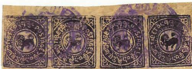
Large multiple, deep violet, with Gyantse strikes (Type I)