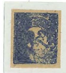
Shiny enamel Cobalt