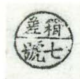
Postman No. 7 receiving mark